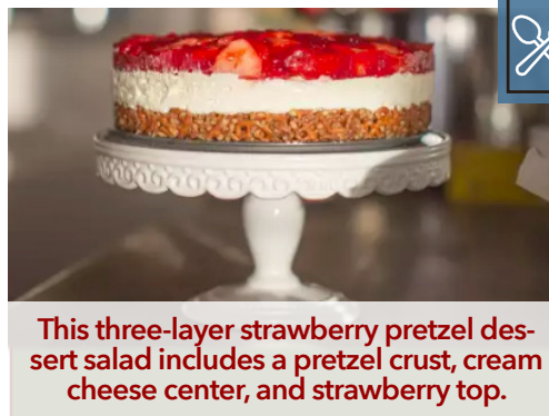
This three-layer strawberry pretzel dessert salad includes a pretzel crust, cream cheese center, and strawberry top.

What do you get from a pampered cow? Spoiled milk!